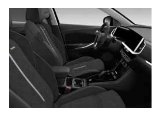
Jet black GSe Alcantara Suede with leather effect seat trim