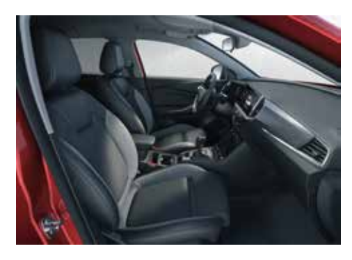
Jet black fabric seat trim inserts with black premium leather-effect side bolsters