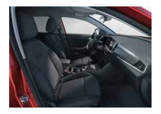
Jet black fabric seat trim inserts with black fabric side bolsters