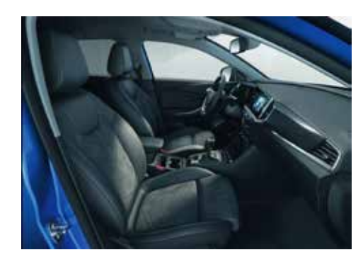
Jet black Alcantara suede with leather effect seat trim